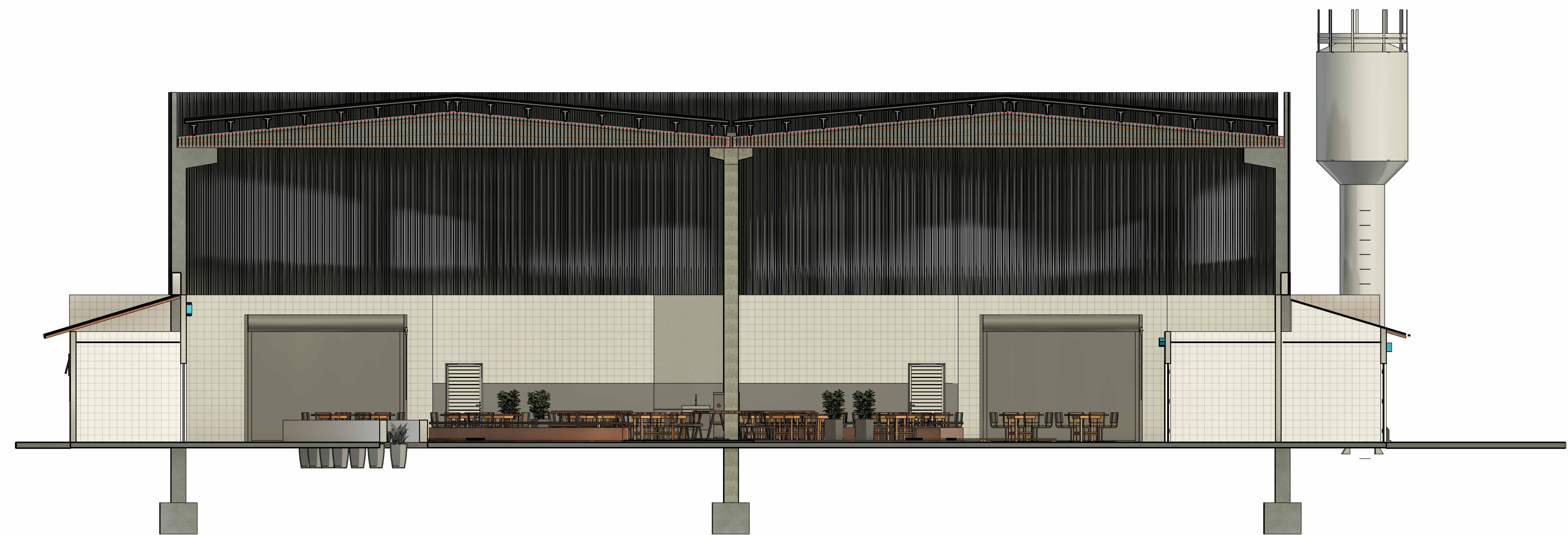
4 Corte 23 1 : 75